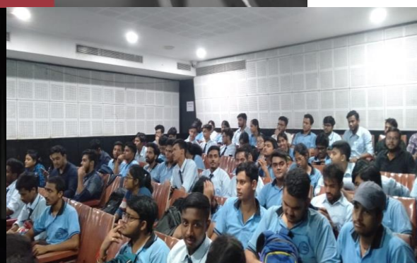
Some pictures of the event