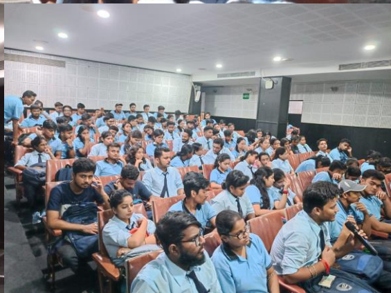
Some pictures of the event