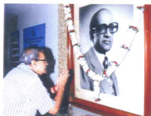
Garlanding by the Academic Dean