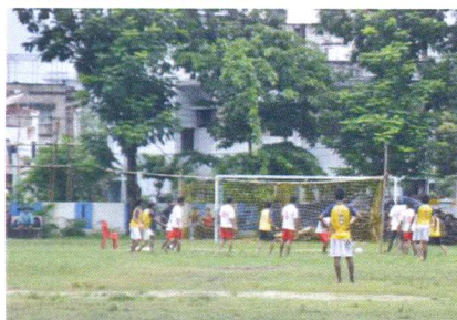
Game in progress