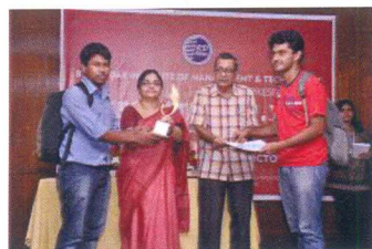
Principal & Dean giving trophies