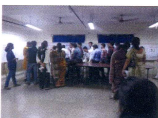
Poster presentation going on