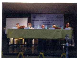
Delegates on the dais