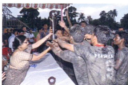
Principal handing over the champions' trophy