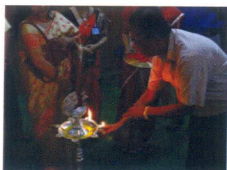
Lighting of diya