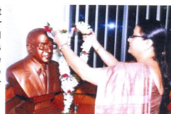
Garlanding by the Principal