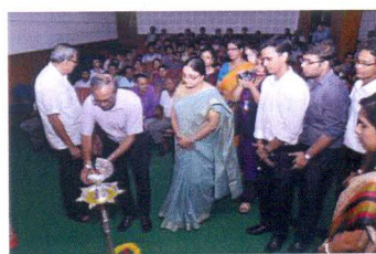
Inauguration by Chief Guest